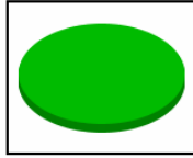
This Week's Uptime Percent Report